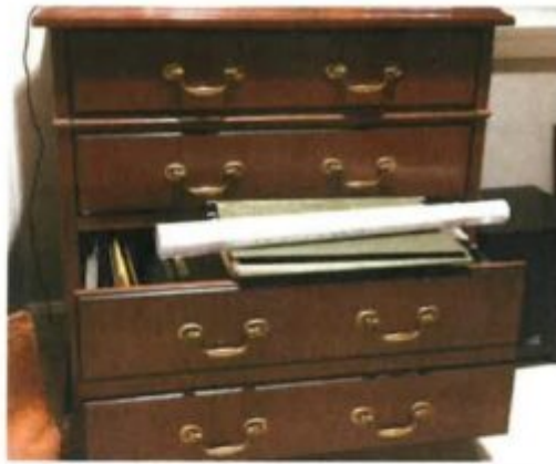
File cabinet in Virginia home's basement office (March 8, 2018) 688