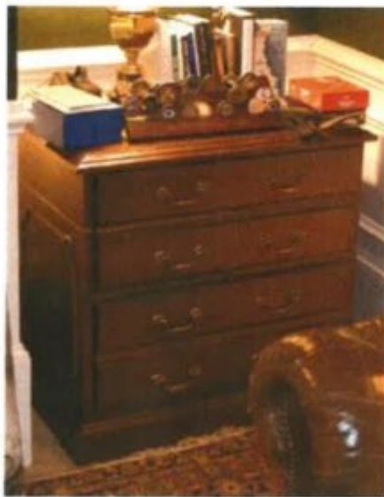
File cabinet in Delaware home's basement den (Jan. 12, 2023) 689