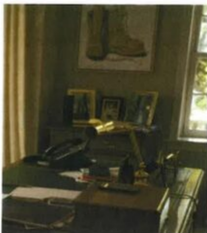
File cabinet in Virginia home's basement office (Sept. 21, 2017) 687