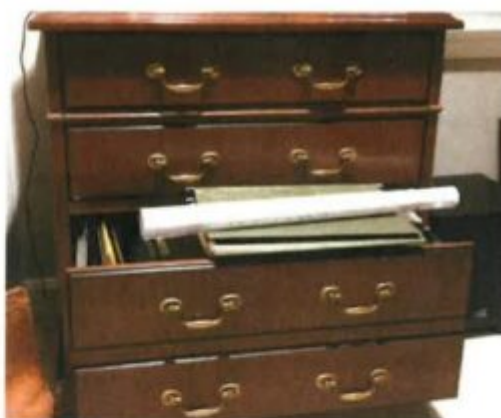
File cabinet in Virginia home's basement office (March 8, 2018) 688