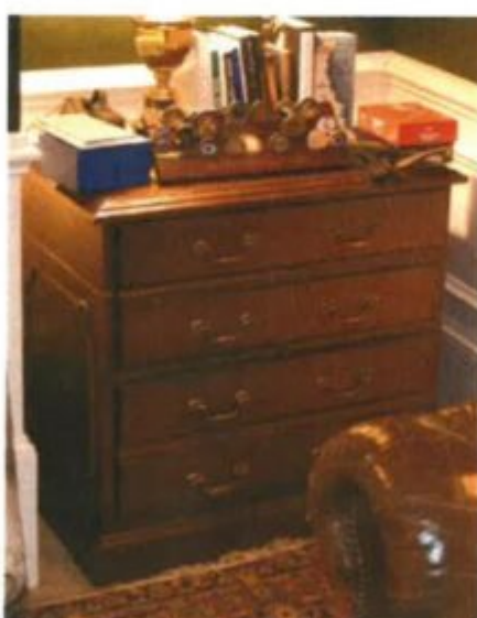
File cabinet in Delaware home's basement den (Jan. 12, 2023) 689