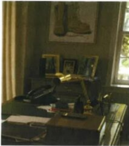
File cabinet in Virginia home's basement office (Sept. 21, 2017) 687