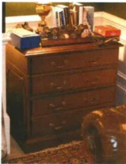
File cabinet in Delaware home's basement den (Jan. 12, 2023) 689