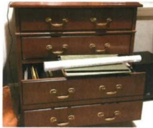
File cabinet in Virginia home's basement office (March 8, 2018) 688