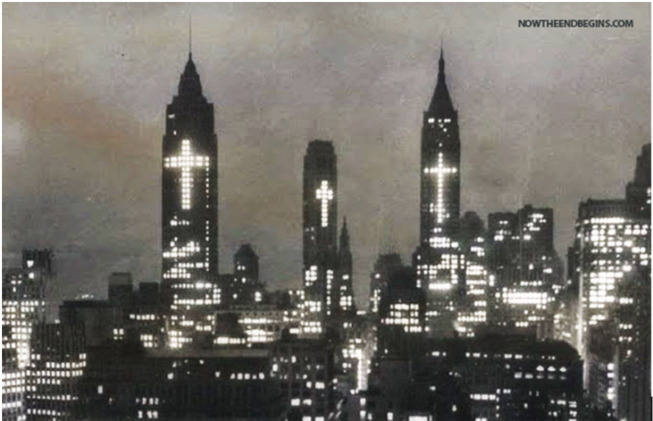
3/29/1956 New York – Huge crosses, formed by lighted windows blaze above New York's skyline as part of an Easter display in Manhattan's financial district. This scene photographed from the roof of the Municipal Building features 150-foot-high crosses in the following buildings (L-R) the City Services Co.; City Bank – Farmers Trust Co.; and the Forty Wall Street Corp.

On Easter (correctly called the Resurrection Of Jesus Christ) March 31, 2024, we promote THIS .